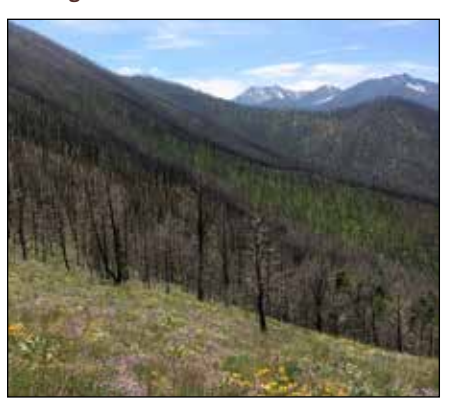
Pony Fire area in Beaverhead - Deerlodge National Forest.

Scientists predict that fire severity, fire occurrence, and burn area in the western U.S. will drastically increase due to the effects of climate change. These predicted changes in wildfire regimes threaten the resilience of forested ecosystems, potentially causing dramatic shifts to new plant communities