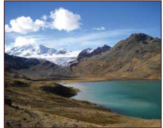
Puca Glacier Chronosequence, Peru.