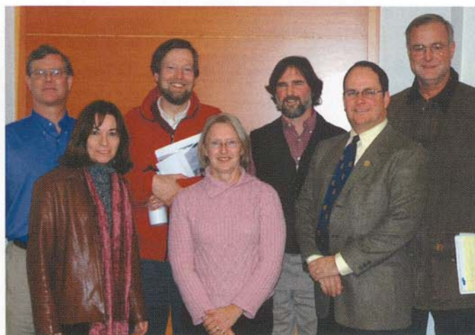
MSU Advisory Committee

The MSU NSF EPSCoR Internal Advisory Committee held their first meeting on December 3, 2004. The committee members were appointed to represent a variety of disciplines at Montana State University. This committee was established to oversee the Montana State University NSF EPSCoR program, to make recommendations, and to oversee the future programmatic growth. This meeting offered insight into the history of EPSCoR's funding distribution, the new programs that will be available, and how and where funding will be distributed in the current 2004-2007 grant. Each committee member received a copy of the new 2004-2007 Montana State University-NSF EPSCoR Implementation and Procedures Manual. The committee will meet again in May 2005 and continue semi-yearly after that.